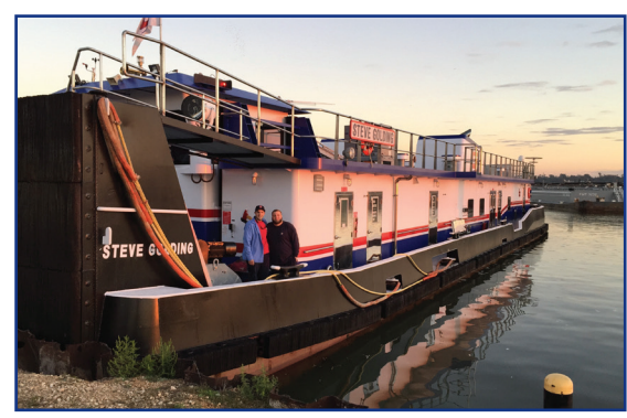
Many of Mississippi's family-owned towing companies are responsible for safely moving $1.4 billion in petroleum products every year.