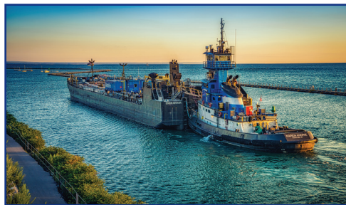
Michigan's Maritime and Port Facility Assistance Grant Program provides an avenue to attract and expand maritime business in the state.