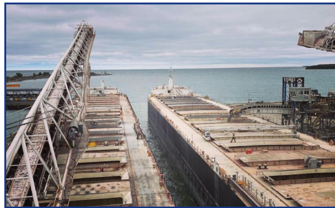
With 37 deepwater ports, Michigan has more ports than any other Great Lakes state or province and has ample capacity to expand maritime operations.

Michigan ports handle 51.7 million tons of cargo worth $4.1 billion annually. Michigan is one of the most critical links in the efficient movement of products that we use every day.