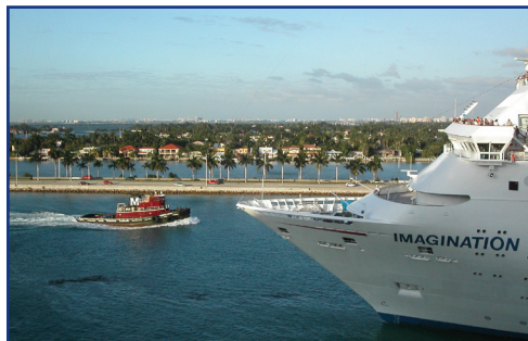
The cruise ship industry is an important part of Florida's maritime landscape. These ships, alongside hard-working tugboats, rely on busy Florida ports for their successful operations.